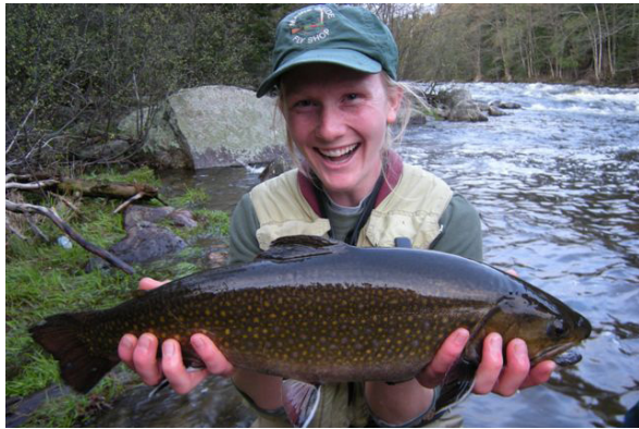
Brook trout need to move up and down stream...

Who Benefits: Fish, wildlife, and people