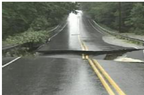
Roads vulnerable to washouts and flooding