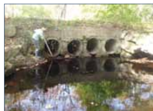
low flow areas