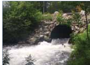
high flow velocity