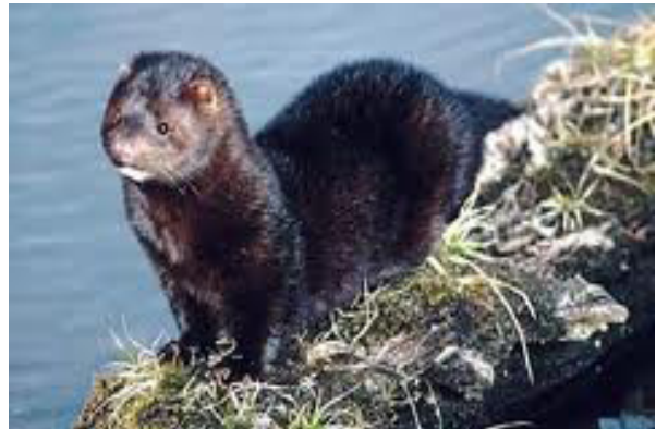
...and mink need to follow the fish.