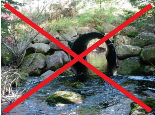
Replace pinched stream crossing...