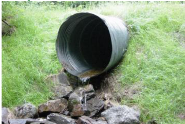
Perched and undersized culverts fragment stream habitat and restrict movement of fish and other wildlife