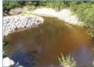
scouring and erosion

are above the level of the stream bottom at the downstream end. Perching erodes streambeds and can prevent wildlife from migrating upstream. They can result from either improper installation or from years of downstream bed erosion.