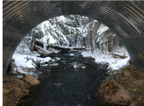
...with spanned stream crossing