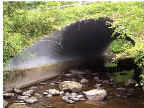
...natural streambed materials