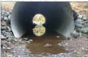
culvert properly embedded into streambed